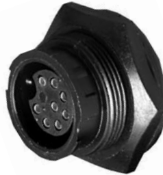
Panel Mount 4X8X-XXB-XXX Matching Mates: • Cable Pin 3X8X-XPB-XXX • Cable Socket 3X8X-XSB-XXX